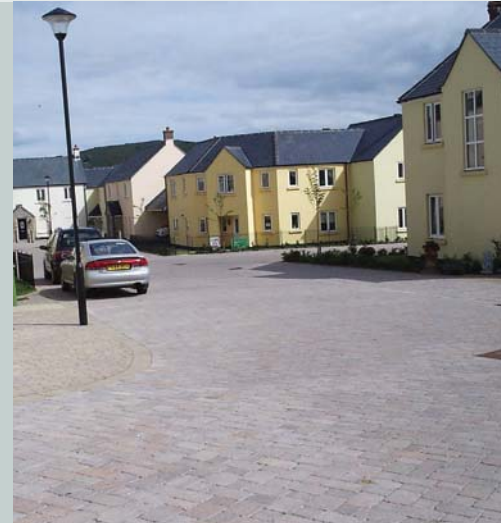
»» New development Home Zone in Moretonhampstead, Devon