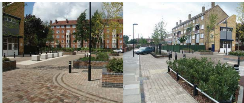
»» Home Zones within a council-owned estate in North Portsea, Portsmouth